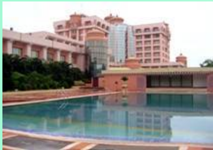
Hotel Swosti Plaza, Bhubaneswar