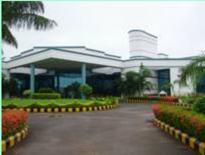
Satyam Campus, Bhubaneswar