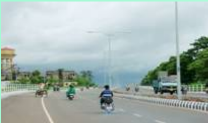
Well planned Roads