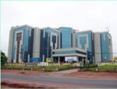
Fortune Tower – Futuristic IT Hub