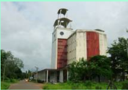
Utkal University, Bhubaneswar