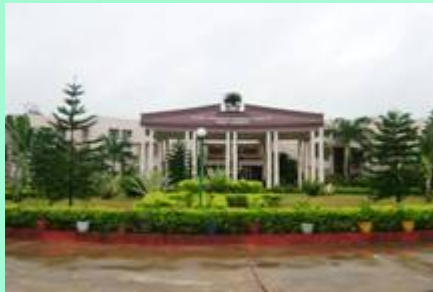
KIIT Deemed University, Bhubaneswar