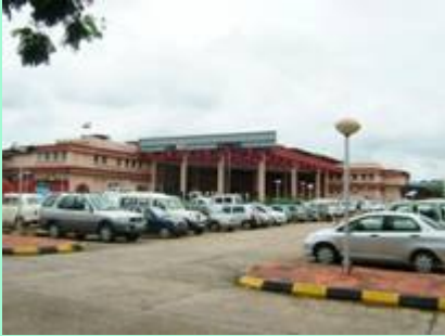
Biju Patnaik International Airport