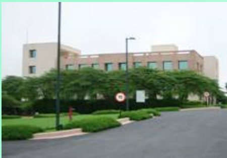
Infosys Campus, Infosys, Bhubaneswar