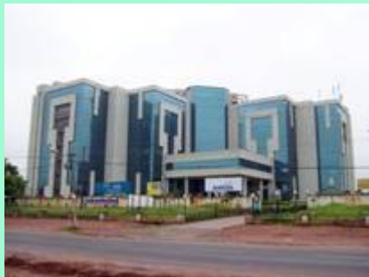
Fortune Tower – Futuristic IT Hub