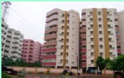
Well planned Residential Complex