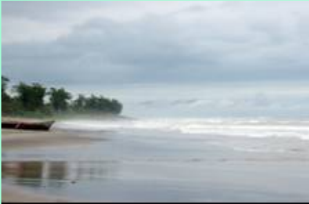
Exotic Beach at Puri