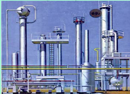
Energy & Power