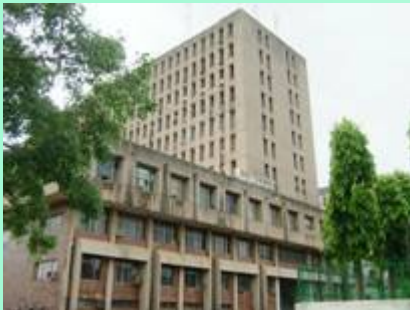
IDCO Tower, Bhubaneswar