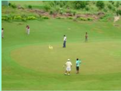
Nine hole Golf Course at Infocity